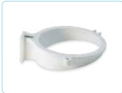
Support ring for FLOVAC ® container with 25x5 mm hook (standard) with 30x5 mm hook with 41x4 mm hook with 45x5 mm hook.