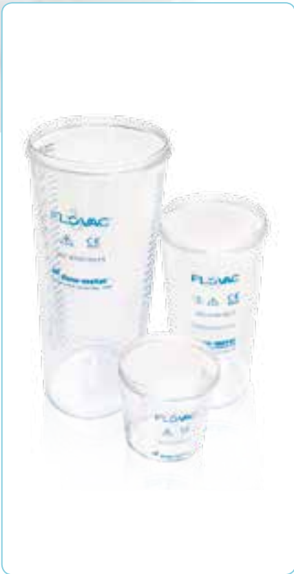
Reusable support jars ( LINER version) 1.0 L, 2.0 L, 3.0 L in polycarbonate, autoclavable.