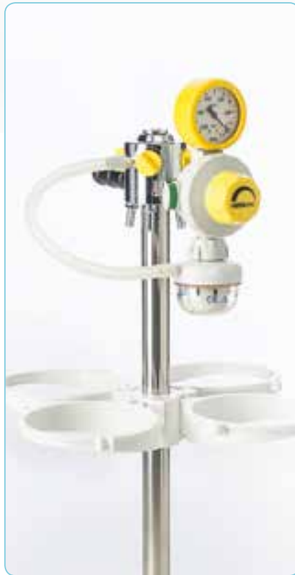
4-places trolley for FLOVAC® container with 4 support rings, ON-OFF taps and side fitting vacuum regulator with safety jar.