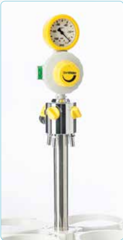
4-places trolley for FLOVAC® container with 4 support rings, ON-OFF taps and vacuum regulator.