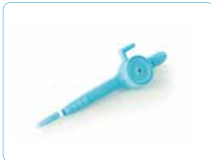
Disposable VACUUM breaker. 50 pieces/box