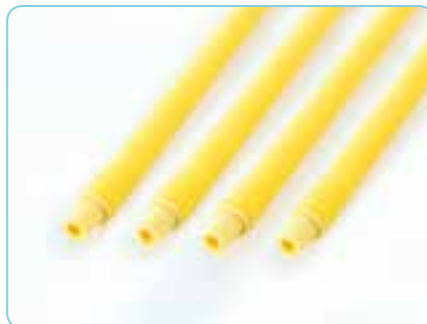
Hose Ø 7.5x11.2 mm - L=0.38 m with connector to supply the VACUUM port. 50 pieces/box