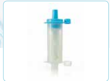
Specimen container. 10 pieces/box