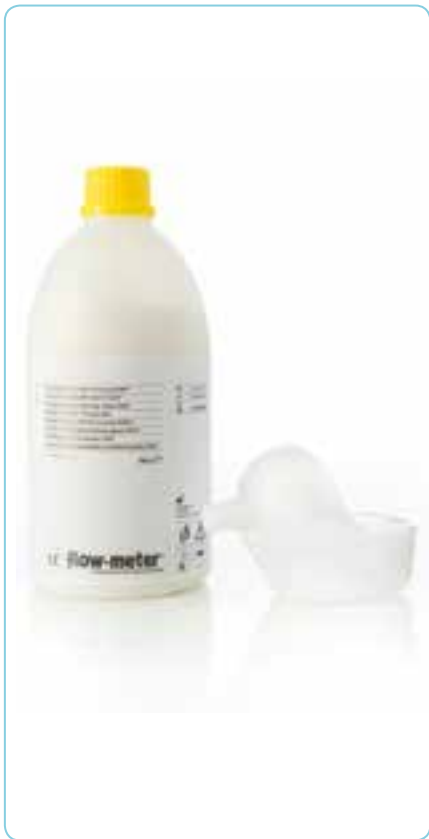
Gelling powder in 500 g. bottles with funnel/doser. 10 bottles/box