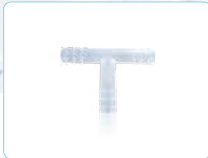
"T" connector for wall TANDEM applications. 100 pieces/box