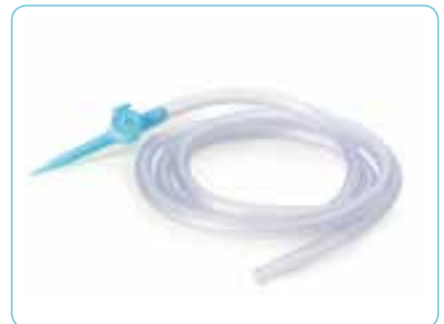
Hose Ø 7.5x11.2 mm - L=1.8 m with disposable VACUUM breaker. 100 pieces/box