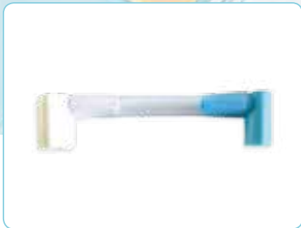
TANDEM connection system. 100 pieces/box