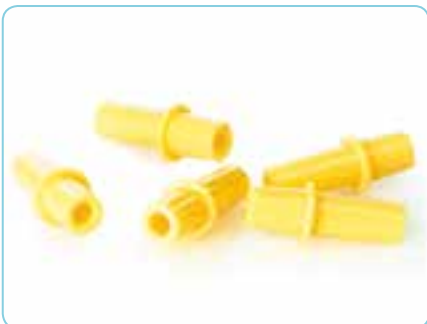
Reusable polycarbonate connector to supply the VACUUM port. 25 pieces/box