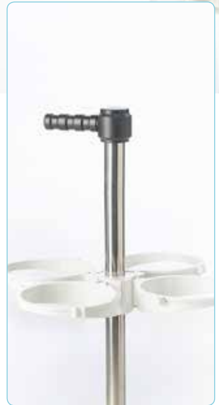
4-places trolley for FLOVAC® container with 4 support rings, and handle.