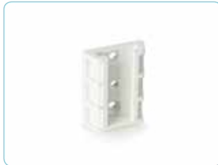
25x5 mm slide wall plate (standard) 30x5 mm slide wall plate 45x5 mm slide wall plate.