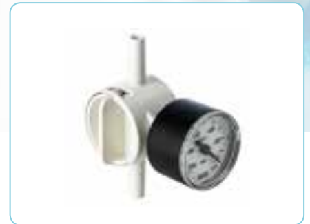
ON-OFF tap with or without control vacuum gauge, for fitting FLOVAC ® container support ring.