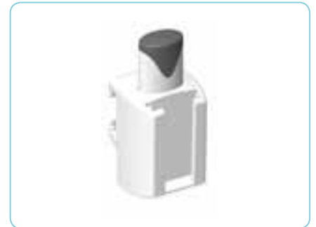
Bracket for 30x10 mm rail in technopolymer with 25x5 mm slide.