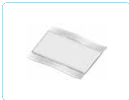
Special gelling powder bag for all sizes of CANISTER FLOVAC® . 50 pieces/box