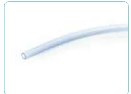
Hose Ø 7.5x11.2 mm - L=0.38 m for TANDEM connection. 50 pieces/box