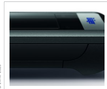
Rubberised handling area for a secure grip