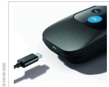
USB-C interface for easy downloading (while stationary or on the move)