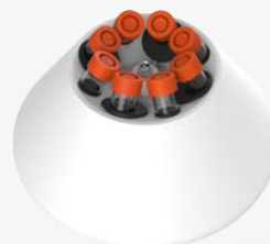
8 x 15ml | 1985 g