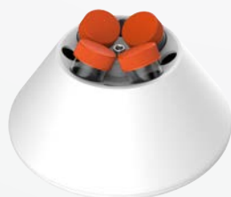
4 x 50ml | 1985 g