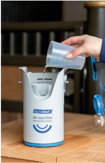
Fig. 1 Fill chamber 1 with contact liquid.