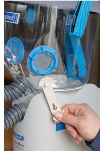
Fig. 4 Secure the mask with rubber straps and attach the connection tube.