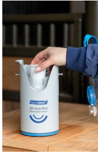
Fig. 2 Insert chamber 2 (filled with inhalation liquid).