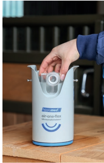
Fig. 3 Put on the nebulising chamber lid.