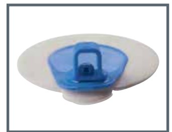
A = 4 mm fitting